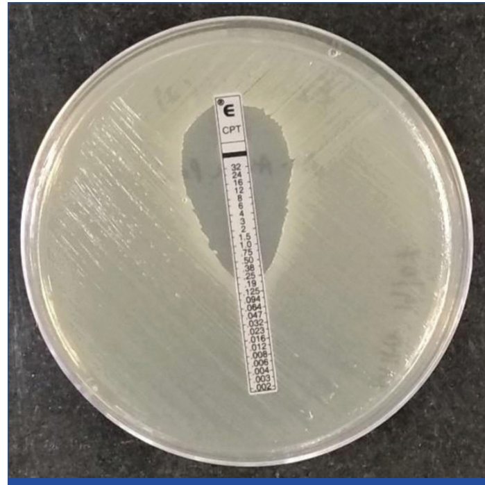
[Table/Fig-5]: MRSA isolate with ceftaroline MIC of 0.25 µg/mL

A MRSA isolate with ceftaroline MIC of 0.25 \mu\text{g/mL} is shown in [Table/Fig-5].